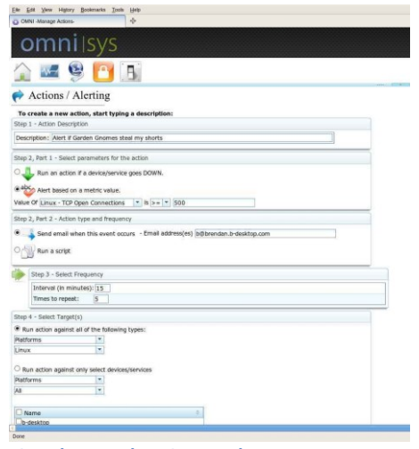
Omnisys Action Screenshot

ZK seemed to really focus on a non-intrusive concept that would abstract everything it needed to, and nothing it didn't. Where I needed to write raw code, I was able to, and never felt the need to compromise functionality, or feel that an opportunity was missed as a result of the framework.